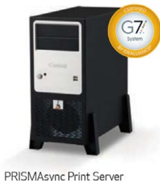
PRISMAsync Print Server